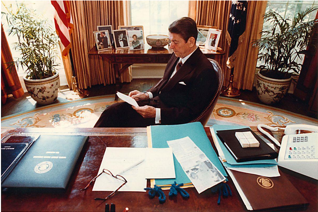
Ronald Reagan in the Oval Office.