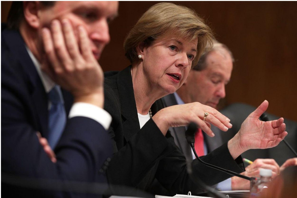
Sen. Tammy Baldwin at a Senate hearing in November 2017.