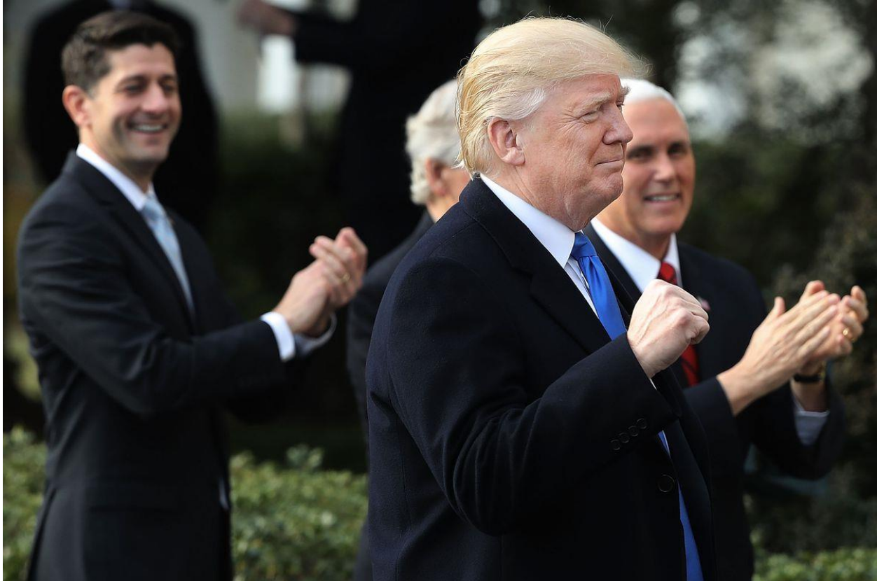
President Donald Trump pumps his fist during an event to celebrate Congress passing the Tax Cuts and Jobs Act in December 2017.